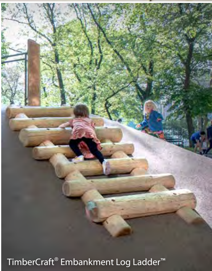
TimberCraft® Embankment Log Ladder™