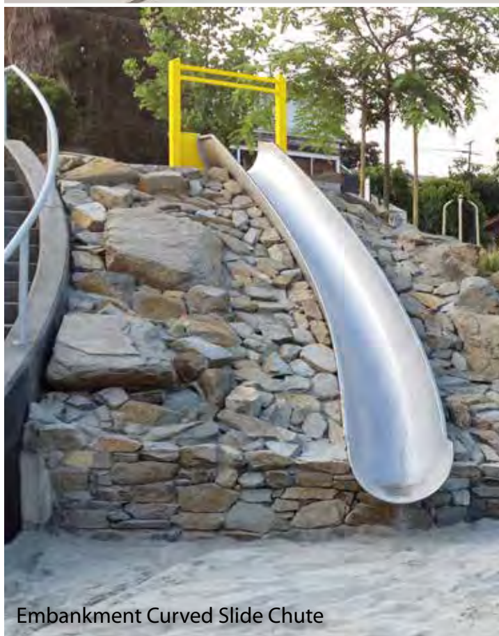
Embankment Curved Slide Chute