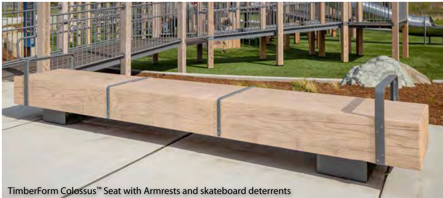
TimberForm Colossus™ Seat with Armrests and skateboard deterrents